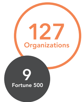
ABB-Dodge Acadia Lead Management Services ACCO Brands Adams Robinson Construction Air Force Institute of Technology